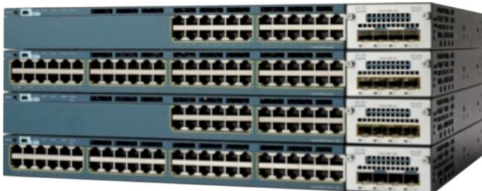
Figure 2. Cisco Catalyst 3560-X Series Switches

Figure 2 shows Cisco Catalyst 3560-X Series Switches.