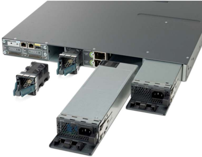
Figure 5. Dual Redundant Power Supplies

Table 6 shows the different power supplies available in these switches and available PoE power.