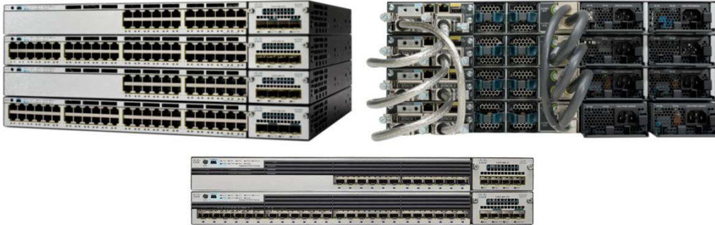
Figure 1. Cisco Catalyst 3750-X Series Switches (Front and Back)

Table 1 shows the Cisco Catalyst 3750-X Series configurations.